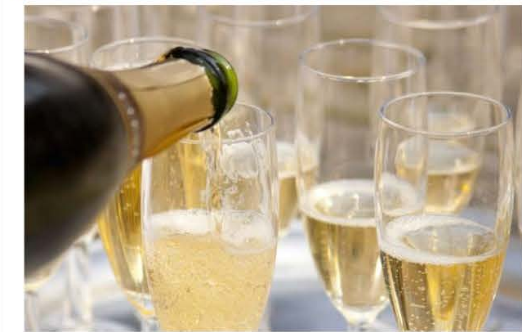
Sparkling wines are gaining in popularity, with sales valued at $33.9 billion in 2019 and expected to reach $51.7 billion by 2027