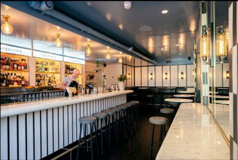
Enjoy Cool Interiors and Awesome Food at Swift x Havana Club New Hot 4 U Brunch at Swift Shoreditch