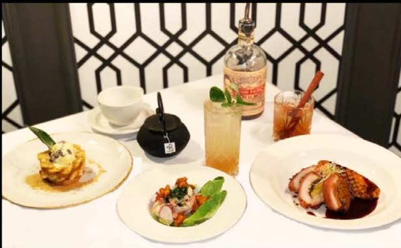
London Cocktail Month Must-Do's - Romulo Cafe & Restaurant's Special Sugarlandia Menu with Don Papa Rum Cocktails