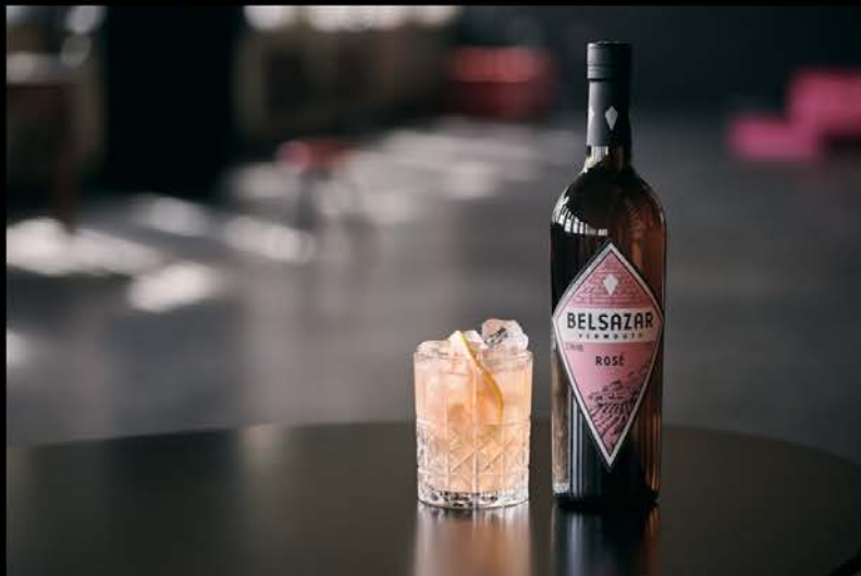
Cafe Belsazar at Hicce (Pictured Belsazar Mood_Rose Germano Mexicano)