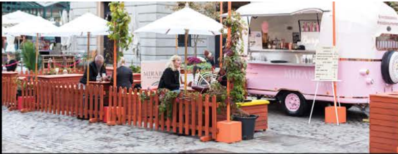
Rosé Away the Days with Mirabeau en Provence for London Cocktail Month

To celebrate LCM, Mirabeau en Provence's airstream bar Coco will be open on the North side of Covent Garden so you can enjoy a chilled rosé, or a dry rosé gin cocktail until Sunday 1st November. Be transported to France with the 'Spritz en Provence' and the 'Spiced Pear Collins' (Thursday - Sunday) along with Mirabeau's collection of wines - Pure, La Folie and Pret-a-Porter. Meanwhile, Wild by Tart will also be serving up a Mirabeau based cocktail for the month of October with 'The Harvest Martini' - a delightful combo of Mirabeau Rosé Gin, Sauternes wine, Lillet Rose and a dash of rose water. Grab your London Cocktail Month wristband and enjoy these gorgeous cocktails for £6 each.