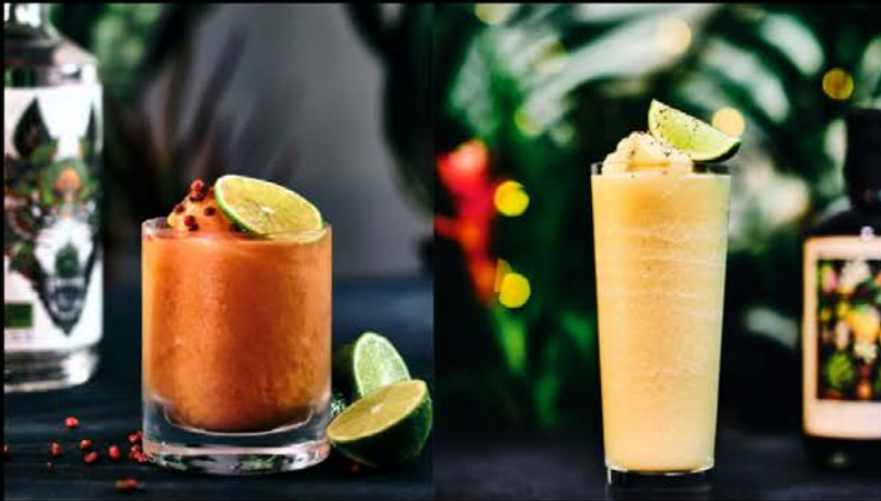
Try the Howlin' Wolf and Pina Colada Slushies at participating Brewdog's across London

Brewdog are getting in on the LCM action with some luscious slushies throughout October. Try a £6 botanically loaded pina colada with Five Hundred Cuts rum, pineapple juice, Coco Lopez, fresh lime and sugar and grated nutmeg, or a Howlin' Wolf with LoneWolf cactus and lime gin, orange liqueur, fresh lime and pink peppercorn sugar syrup. Available with your wristband at the following participating bars: Clerkenwell , Dalston , Soho , Seven Dials and Shoreditch .