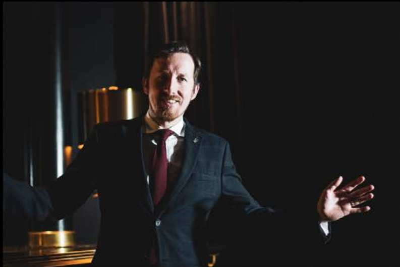
London Cocktail Month Must-Do's – An Exclusive One Off Event – The Last Dance at 12th Knot at Sea Containers on 15th October

An Exclusive One Off Event – The Last Dance at 12 th Knot at Sea Containers on 15 th October