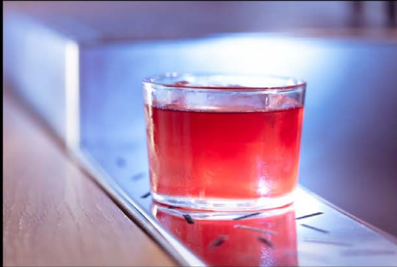
Tayer X Bombay Sapphire Workshops & Maker's Mark Bourbon Masterclass at Tayer + Elementary, plus sample the Fragolino Sour

Tayer X Bombay Sapphire Workshops & Maker's Mark Bourbon Masterclass at Tayer + Elementary