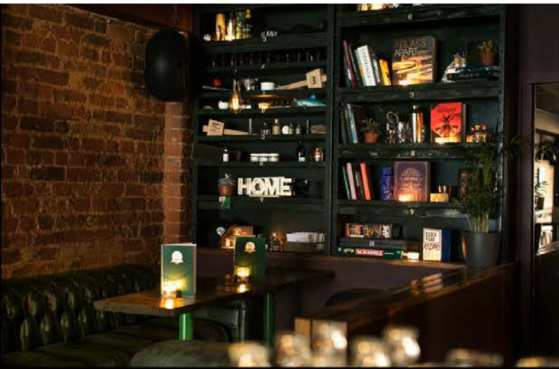
London Cocktail Month at Homeboy Includes new cocktails and Tuesday takeovers

Homeboy celebrates LCM with two new £6 cocktails to enjoy including the Homeboy 'Henny Coke' (Hennessy VS Cognac, Falernum, Port, Luxardo Sangue Morlacco & Cherry Coke) and the 'Homeboy Irish Coffee Bitters'. There's also a cheeky champagne cocktail on offer at just £9 – the Moët based 'Very French 75'. Every Tuesday throughout October, Homeboy will also be hosting bar-takeovers with the industry's finest bartenders with special serves available on the night.