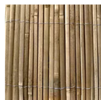
canisse bambou fendu 3 x 2 m 16,90 € - oogarden.com