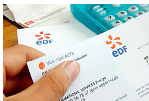
10 fois plus puissants, ces nouveaux panneaux solaires sont une mine d'or pour les propriétaires de maison! Réduisez Vos Factures