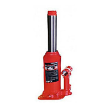
Cric bouteille monovérin - Force 3 à 32 tonnes 39 € - manutan.fr