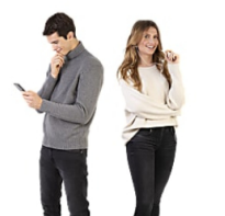
RED 40Go - 10€/mois 40Go = 10€/mois - red-by-sfr.fr