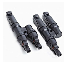
Connecteur MC4 double (mâle et femelle) 9,60 € - solaireshop.fr