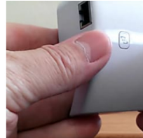
High Speed WiFi Booster Takes France By Storm WiFi Booster