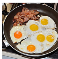
Un docteur révèle: «C'est comme un karcher pour votre intestin» Nutravia