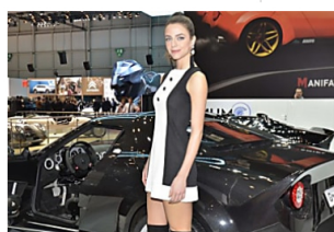
Salon de Genève 2019: les photos des hôtesses Auto Moto